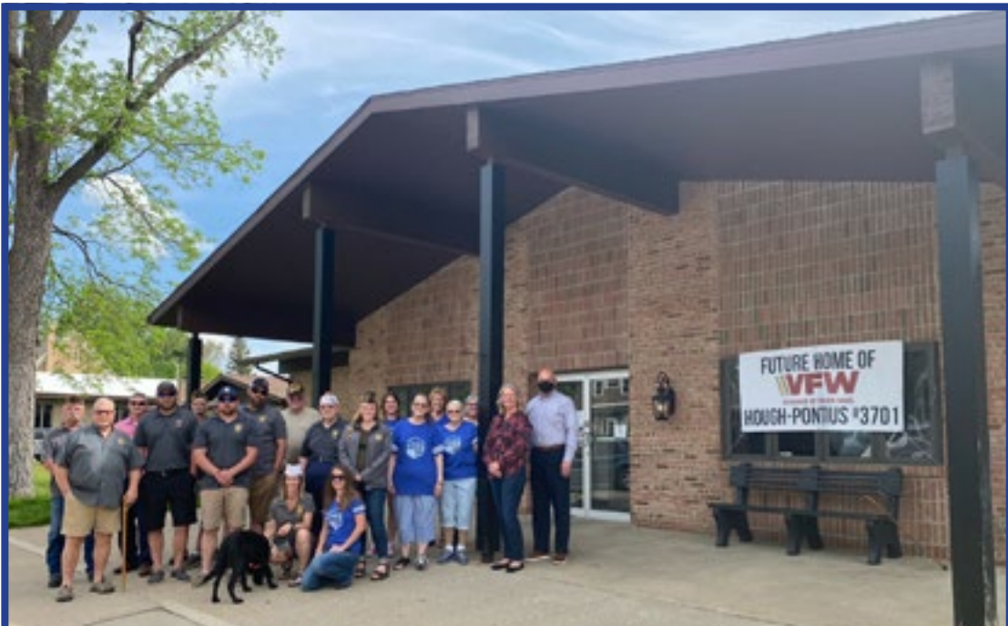
Post & Auxiliary members pose with Mercantile Bank employees and Village of Lakeview Manager in front of new Post home at 506 S Lincoln

The Lakeview VFW Post 3701 is excited to announce that they have a new Post home! The Commander requested a donation of the previous Mercantile Bank building which was for sale for $600,000. After discussions with Mercantile Bank's corporate office and the Village of Lakeview, the Lakeview VFW purchased the building for just $7,500 with the Village purchasing the parking lot and Mercantile Bank donating the rest. It was a big ask of Mercantile Bank but the lesson learned is that it never hurts to ask the question! The Post has sold their previous home which they built in the mid 70's and will use the profits to renovate the new building to include a commercial kitchen, large rental space, private offices and designated meeting spaces. The new building is more than double the size of the previous building, in almost perfect condition and most importantly located in the heart of their community. The new building will allow the Post to offer better services to community and be more involved with village events. A major future goal for the building is to add an elevator and designate the 9,00 square foot basement as a community emergency shelter. The Post is scheduled to host the District 9 meeting in February in the newly renovated space.