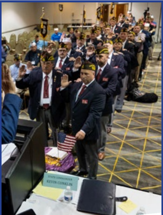
Incoming Officers & Directors swear in